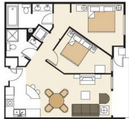
Two Bedroom Two Bath KING Suite 1 King / 1 Queen / 1 Sofa Sleeper

Rates are valid for up to four adults. Any additional adults will be $20 plus tax per night.