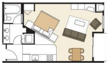
Studio/JUNIOR Suite 1 Queen / 1 Sofa Sleeper

All of our suites include a full kitchen with utensils, dining table, electric fireplace, washer & dryer, jetted tub, air conditioning, cable TV, DVD Player, hair dryer, iron, ironing board.