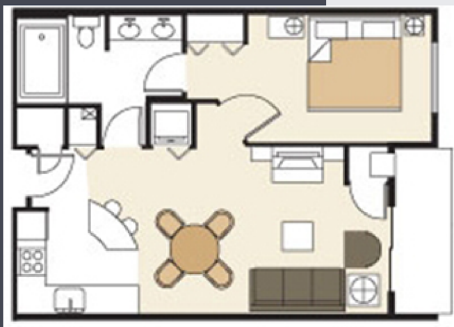
One Bedroom Suite