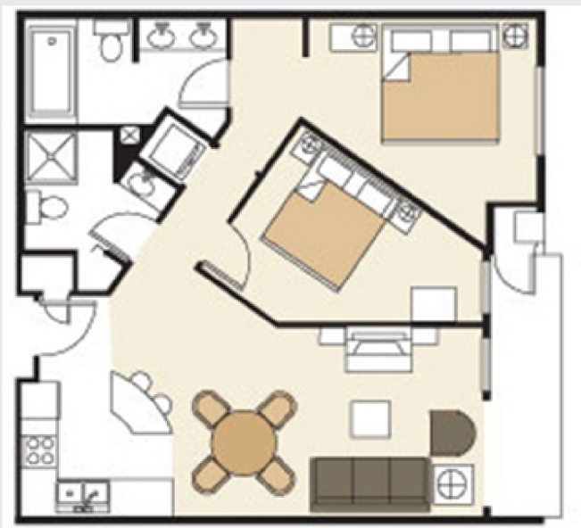
Two Bedroom, Two Bathroom Suite